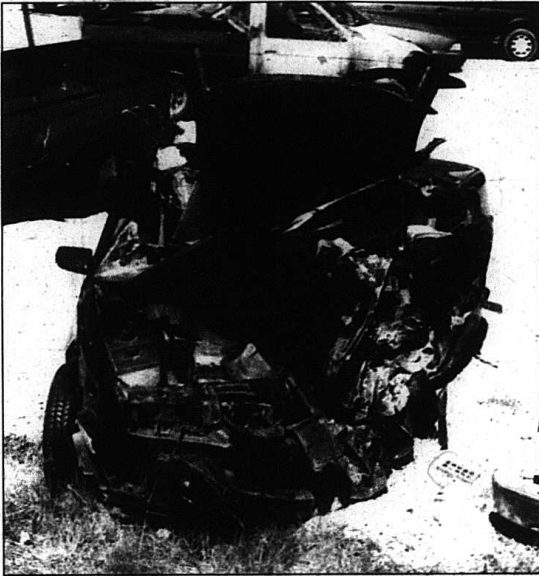
A Michigan man was killed instantly Monday morning when the above car he was driving hit a tractor trailer head-on on Hwy. 461. The Michigan man was the sixth person killed on Rockcastle highways in the past twelve months.