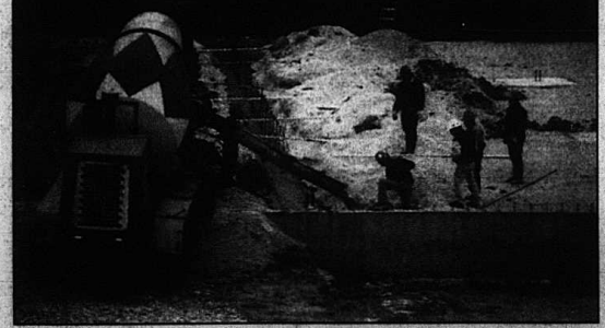
Work is well underway on a new building in the Rockcastle Industrial Park that will house Integrity Mold and Die. The company is relocating from Berea and is expected to be in operation later this year. Earlier this month the Mt. Vernon City Council voted to loan the company $100,000 to be used for equipment purchases. The loan will be paid back over a ten year period with an interest rate of 3.5 percent. The money comes from the city's Urban Development Action Grant fund.