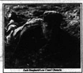
Raider Team competes Pg. A9