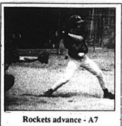
Rockets advance - A7

Mount Vernon, Kentucky 40456 - Volume 113 - Number 34 - Ph. (606) 256-2244 - 50¢ a copy - Thursday, May 25, 2000