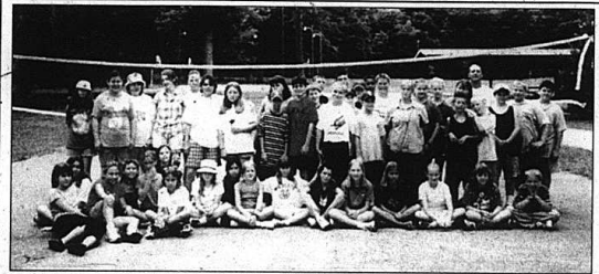
49 campers from Rockcastle County attended the J.M. Felner 4-H Camp in London the week of June 12-16.