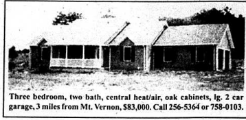
Three bedroom, two bath, central heat/air, oak cabinets, lg. 2 car garage, 3 miles from Mt. Vernon, $83,000. Call 256-5364 or 758-0103.

3 Bedrooms, 1.5 Baths, Range, Refrigerator, 2 Decks (8x8, 12x16), underpinning, Trane Central Heat & Air, Utility Pole, $17,000. (To be moved). 606-256-0047 days or 606-758-0172 nights.