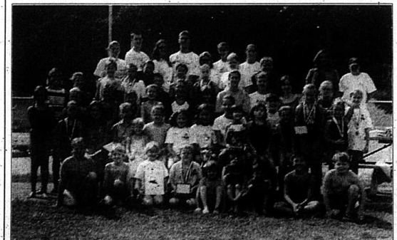
The Cedar Rapids Dolphins are shown with their Lake Cumberland Swim Association Championship Trophy. The Dolphins beat out five other teams in their conference to take the title over Knox County by 14 points. This is the third time Cedar Rapids has captured the championship trophy in the last seven years.