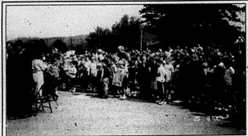
Broadhead Elementary School held groundbreaking ceremonies last Friday with students attending.

Parents please remember to ask your child for the special envelope that each student will be bringing home every Thursday. It contains the principal's newsletters as well as other important papers. Sign the envelope after you have read the contents and return it to school with your child on Friday.