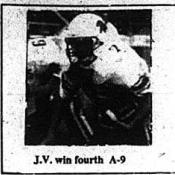
J.V. win fourth A-9