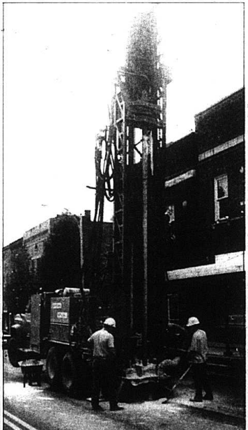
Work crews drilled wells around Mt. Vernon for monitoring devices to see how far contaminated water has spread throughout the city.