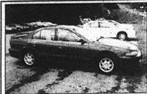
2000 Mitsubishi Galant ES Auto, Loaded, Good Color $13,995/$282 Mo.