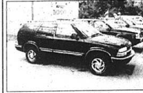
1998 Chev. Blazer LT Leather, Sunroof, Loaded, 37K $17,500/$334 Mo.