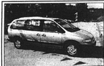
1999 Dodge Caravan SE 4 Dr., Loaded $12,995/$264 Mo.