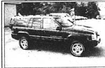
1997 Jeep Grand Cherokee Laredo Limited, 4x4, Leather, V8 $17,500/$356 Mo.