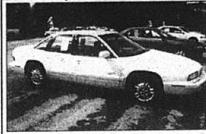
1996 Buick Regal 4 Dr., Loaded, 48K, Local $8,995/$214 Mo.