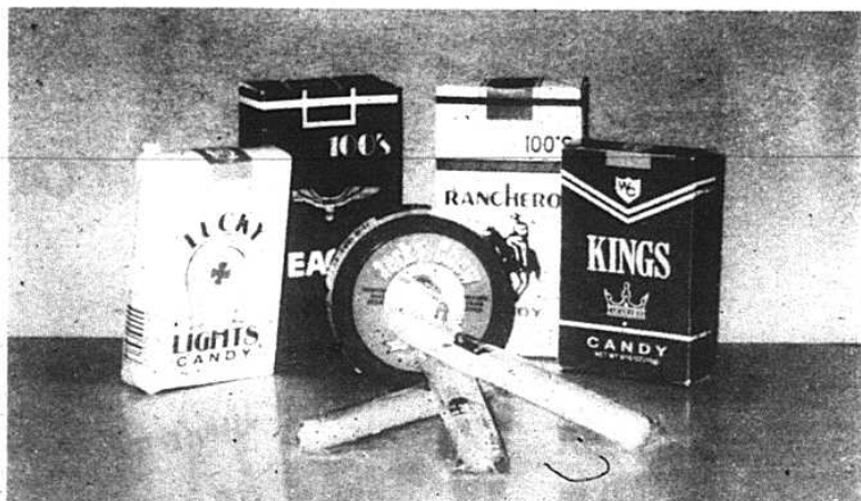
Assorted types and brands of candy mock the looks of real tobacco products. Above are some of the favorite confections from childhood.

One source stated, "Candy cigarettes are to smoking-as training