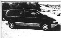
1997 Mercury Villager GS, Loaded, Rear Air, Low Ks $12,500/$270 Mo.