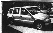
1997 Kia Sportage 4 Dr., 4x4, Leather, CD, 36K 60K Warranty $10,500/$229 Mo.