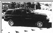
1997 Jeep Grand Cherokee Laredo Limited, V8, Sunroof, Leather, $17,500/$356 Mo.