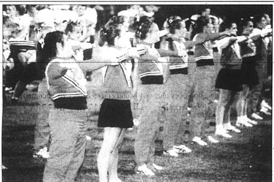
Although a small crowd followed the Rockets to Harlan on Friday night where they dismantled Cawood, the RCHS cheerleaders were on hand as usual. Rockcastle won 52-0 and if they can win on Friday night against Bell County, they will be the first team ever to go undefeated in regular season at the high school. Bell County has lost only one district game this season, that to Whites County on Friday night.