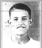
Oh No! Look our brother is turning the Big Six 0! 11-2-00 Happy Birthday from Mom, Brothers & Sisters