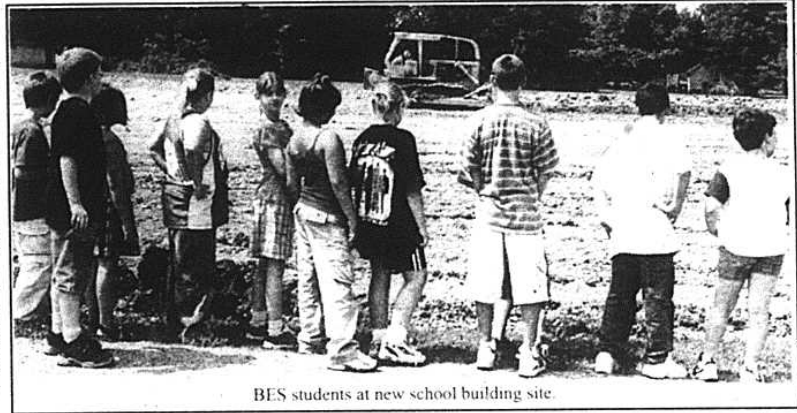
BES students at new school building site.

They began the project by observing and photographing their playground, the preschool building, and the bus walkway being torn down to make way for the new elementary school. Throughout the year, they will be interviewing Brodhead's alumni, students, faculty and staff to learn more of the rich heritage of the school and its impact on the entire Brodhead community.