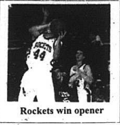
Rockets win opener

Mount Vernon, Kentucky 40456 - Volume 114 - Number 9 Ph. (606) 256-2244 - .50 a copy - Thursday, November 30, 2000