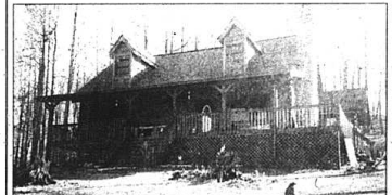
New Listing Rt. 3 Box 153E, Mt. Vernon Road. This 2 year old log home is a must see. Property includes 6.6 acres, 3 bedrooms, 2.5 baths, beautiful stone fireplace, whirlpool in master located on first floor. All this and only 8 miles from Berea. Town in a private setting with a view to die for. MLS#1291082. Call Lesha at 986-8663.