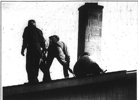
The Brodhead fire department was called to the Sowder Nursing Home on Monday afternoon where they extinguished a chimney fire. No residents of nursing home or none of the employees were evacuated during the fire, which caused very minimal damage to the back of the nursing home.