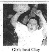
Girls beat Clay