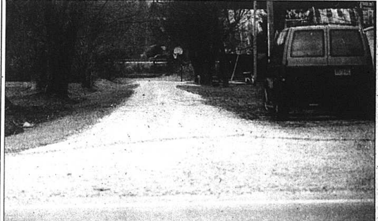
Old Conway Road dead ends at the interstate and has one house on it.

You Are Invited to Attend a Special Presentation