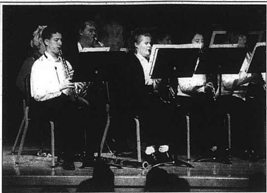
The Rockcastle County High School band presented their annual Christmas Concert in the auditorium at the school on Thursday night.