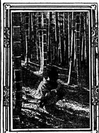
Japanese Bamboo Tree. The Bamboo in the State Wood of Japan and its Uses Local.