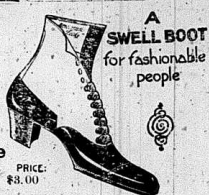
A SWELL BOOT for fashionable people