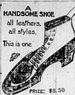
A HANDSOME SHOE all leathers, all styles.

Cotton, the dehydrated kind staples could show only $259,465,649 as against the magnificent earnings of its feathered rival. The crops of flax, timothy, clover, alfalfa and cane seeds, broom corn, castor beans, rice, straw and so forth, couldn't all hold, worse within a measurable distance of many millions of the poultry earnings. The best eggs produced in this country annually would 43,127,000 crates, each of the latter holding 360 eggs, also carrying straw and other material to make up this train—Success.