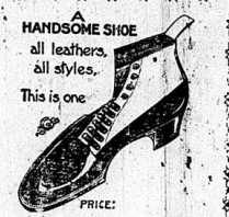
A HANDSOME SHOE all leathers, all styles. This is one.