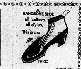
A HANDSOME SHOE all leathers, all styles. This is one