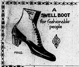
A SWELL BOOT for fashionable people

We have two very progressive Sunday-schools near Orlando, and hope the place will become some-