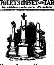
Mount Vernon Monumental Works.

Manufacturer of and DEALER in Marbles and Granite Monuments of all kinds. Estimates furnished on application.