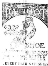
EVERY PAIR SATISFIES