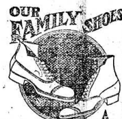
"STAR BRAND SHOES ARE BETTER"

IF THESE SUITS ARE NOT WHAT WE CLAIM BRING THEM BACK.