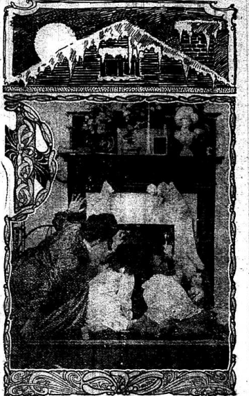
LOOKING FOR SANTA CLAUS.