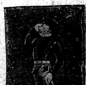
GERMAN CHRISTMAS CAKE - A MERRY WAFFLE.

GERMANY for many years has been the land of Christmas novelties, and each year the latest and most ingenious toy, candy and cake makers devise some oddity which proves irresistible to having small or great sums from the pockets of Yuletide shoppers.