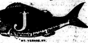
MT. VERNON, KY.