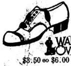
WALK OVER $3.50 to $6.00

You are to judge how well we have served you—we want you to look at the new Spring Styles—buy or not, as you please.