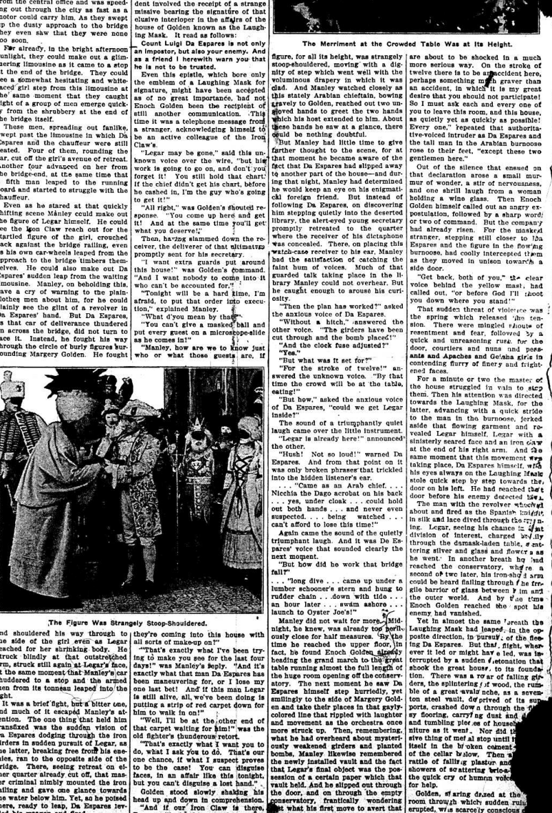
The Figure Was Strangely Stoop-Shouldered.

and shouldered his way through to the side of the girl even as Legar reached for her shrinking body. He struck blindly at that outstreiched arm, struck still again at Legar's face, at the same moment that Manley's car shuddered to a stop and the armed men from its tonnean leaped into the