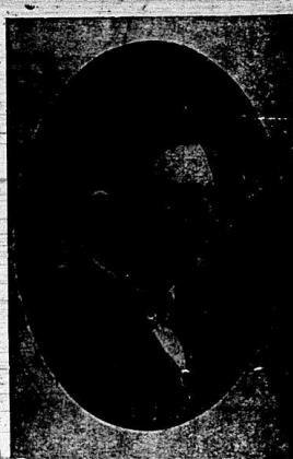
HON. HARVEY HELM

Now I want to tell you what we are doing here in Henderson Co., Ind. The noted old National Highway passes through this county for a distance of about 20 miles. And to show you that it is not only a good road but a dandy, I will tell you what took place on this road between Indianapolis and Terre Haute. There are two railroads running parallel with the old National road. On these railroads they run through fast trains and they go over the line as fast as you ever saw an L. & N. train move. Two men in an automobile loaded with sand bags to