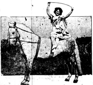
Royals Famous Herd of Performing Elephants who have delighted the hearts of thousands enroute.

Enlarged & Reconstructed for the present season