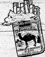
18c. a package

R.J. REYNOLDS TOBACCO COMPANY Winston-Salem, N. C.