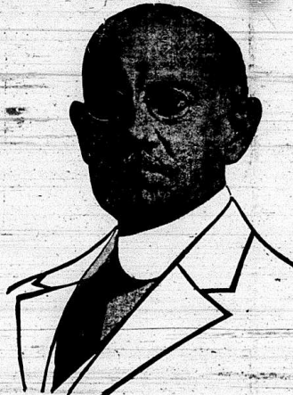
HON. RICHARD P. ERNST. SENATOR ELECT

Don't hunt off your own land without license. Don't shoot without this year's hunting license. Don't shoot doves before September 1st nor after December 15th. Don't kill more than fifteen doves in one day. Don't shoot quail before November 15th nor after January 1st. Don't kill more than twelve quail in one day. Don't shoot squirrel before July 1st nor after December 15th. Don't kill woodcock before November 15th nor after January 1st. Don't kill more than six woodcock in one day. Don't kill wild turkey, imported pheasants or Hungarian partridges before November 15th 1924. Don't shoot, buy or sell rabbits before November 15th nor after January 1st. Don't hunt, pursue, chase, catch, kill, injure or molest any deer before November 15th, 1925. Don't kill any wild fowl, wild geese or jacksnipe before September 15th nor after January 1st. Don't set steel traps before Nov. 15 nor after January 1st. Don't have fur bearing animals in your possession before Oct. 1st nor after Feb. 15.