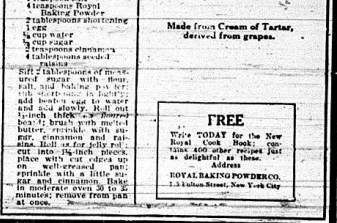
ROYAL BAKING POWDER

ROYAL BAKING POWDER Absolutely Pure Made from Cream of Tartar, several from grapes.