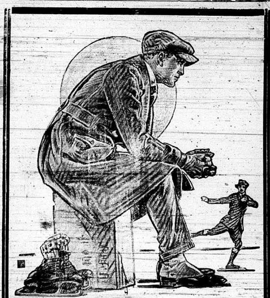
Copyright 1920 Hart Schaffner & Marx