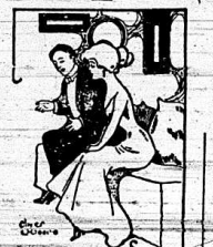
SHE WAS WISE.

He father the proposal—My salary is $1,500 a year. Now, dearest, what is the least you can live on? Well, how much credit can you get.