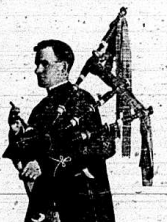
Big pipes, Scotch songs and dance are special features of the famous Kiltie's concert at our Chautauque. Here Chautauque Week: July 2-7