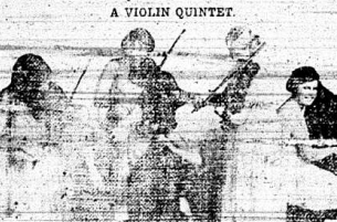
A VIOLIN QUINTET. The five young musicians are a sister, all musicians since early childhood.