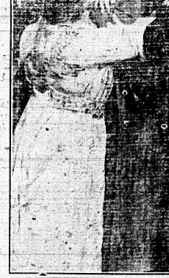
After seeing the play, President Wilson arose in his box and said: "I hope that the spirit of this delightful play will soon grip the nation." It is gratifying to know that the play has been secured for our Chautauque

There has been no patriotic play for his son, aided by the sympathetic understanding of his wife, and the constant pleas of his ill-fated son, convincing him to perform. It is a play that every one should hear. In the above scene, through the love