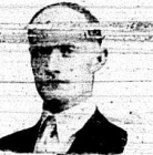
J. H. LAMBERT