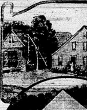
Birthplace and childhood home of Mary Baker Eddy. Near Concord, New Hampshire.