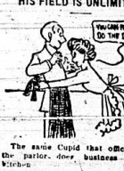
The same cupid that officiated in the parlor, does business in the kitchen.