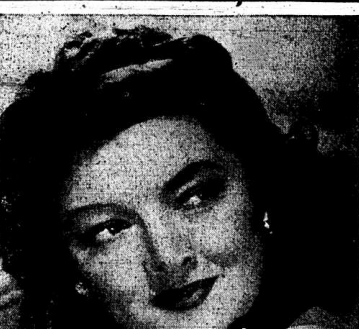
Several years ago Myrna Loy set a vogue, and became almost overnight one of the most popular stars in picture history.

Now in "Love Crazy" Miss Loy has reached a new high in audience popularity, with Bill Powell the erratic but devoted trouble maker.