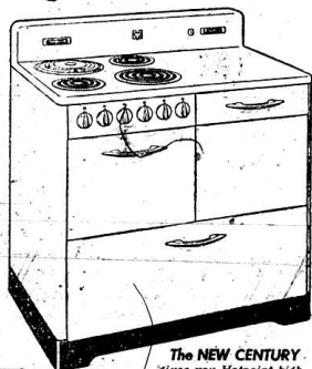
The NEW CENTURY gives you Hotpoint high quality at a real low price!