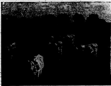
Good Pasture Promotes Heavy Milk Flow by Dairy Cattle.

CHICAGO—The green pastures' culture improvement that boosts the can help dairy farmers cut steadily rising production costs by providing low cost fodder to pinch hit for high-priced corn and other feed grains, according to a statement made public here by the Middle West Soil Improvement Committee. "Production costs have gone up faster than market prices for dairy products since the war," says the statement. "Farmers are paying more for corn, feed grains, milk cans, cream separators and other materials. Farm wages have reached an all-time high." "Before V-J Day, one pound of milk would buy 1.33 pounds of cattle feed. Today it will buy only 1.2 pounds. During the war a pound of butterfat would buy nearly 26 pounds of feed. Now it will buy only 22.4 pounds." "The cheapest and best feed a farmer can get comes from pasture. Thus, an investment in pas-