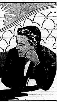
Carolyn had to keep reminding herself that it was earth she lived on, not really heaven.

that she could have stopped him with a word, but she did not speak. This was the Lee whom she had treasured in her heart for eleven years! Lee, tall, but, with shoulders sloped; still lean, but with a follow-cherished look. Lee, his blue eyes intent now only with a near-sighted, peering expression; his hair no longer unruly, because there was not enough of it to be, just some wisps "barrowed" from one side to cover a bald spot. And it was obvious that for all he saw of the life butting around him, he might have had his eye bent to a microscope as he walked.