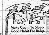
Make Going to Sleep Good Habit for Baby

Don't do this! Don't do that! Every mother knows the constant stream of "don'ts" that cascade on her from every side from relatives and friends. It's true that each stage of your child's training and development brings with it a set of rules—things to avoid—but take your advice from your doctor or from a child expert. Sleep habits are an important part of growth and they, too, have their "don'ts."