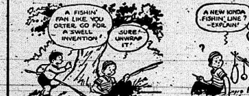
RECLAR FELLERS By Gene Byrnes