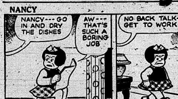
NANCY By Ernie Bushmiller