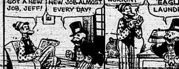
MUTT AND JEFF By Bud Fisher