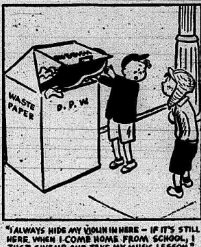
"ALWAYS HIDE MY VIOLIN IN HERE - IF IT'S STILL HERE WHEN I COME HOME FROM SCHOOL, I JUST GIVE UP AND TAKE MY MUSIC LESSON"