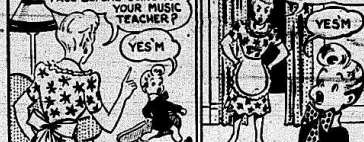
LITTLE REGGIE By Margarita