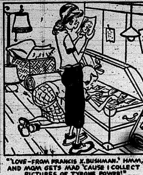
"LOVE-FROM FRANCIS X. BUSHMILLER," HMM, AND MOM GETS MAD 'CAUSE I COLLECT PICTURES OF TYRONE POWER!"