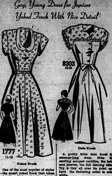
Gay, Young Dress for Juniors Yoked Frock With Nice Detail! 8303 12-20 1777 11-10 One of the most popular of styles—the smart yoked frock that takes so handsomely to contrasting fabric. This charming version can have a ruffle around the bottom, if you wish. Pattern No. 8303 comes in sizes 12, 14, 16, 18, and 20. Size 14, cut yards of 38-inch; 1/4 yard for yoke and sleeves. Pattern No. 1777 is for sizes 11, 12, 14, 16 and 18. Size 12, cap sleeves. Yoke of 38-inch; 1/4 yard for collar. Send today for your copy of the Spring—Summer FASHION—wanted model. DDT is a top flight designer; easy to make frocks; free patterns and free knitting directions printed inside the book, 25 cents.

Tam Loon Fly Immunity to DDT Is Debatable Question Some Insects Develop Strain of Resistance Do flies become immune or resistant to DDT after it has been used for a few years? This question arises from the fact that a few fly-control failures on farms where DDT was effective in other years have been hard to account for. The explanation was that the flies probably had become resistant to the chemical. Uncle Sam's entomologists admit that insects can develop resistance to the insecticide used against them, as in the case of the apple codling moth against which lead arsenate lost its effectiveness. Moreover, Uncle Sam's bug men say they have, in the laboratory, been able to develop a DDT-resistant strain of flyer. It is not likely that DDT-resistant strains would develop naturally in the short-time since DDT was first used. It is more reasonable to believe that the occasional failure of DDT where DDT already has been used with good results is due to carelessness or inferior product. One thing in particular that should accompany the use of DDT is the destruction or removal of fly breeding places, such as manure piles, water tubs, old stables, broken wet spots in barnyards. One or more such spots may be able to turn out flies faster than DDT can kill them, for DDT is not used for fast action. A fly may survive for hours after alighting on a surface treated with DDT.