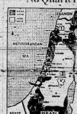
Map of the Middle East region.