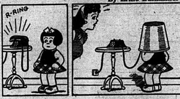
R-RING By Ernie Bushmiller