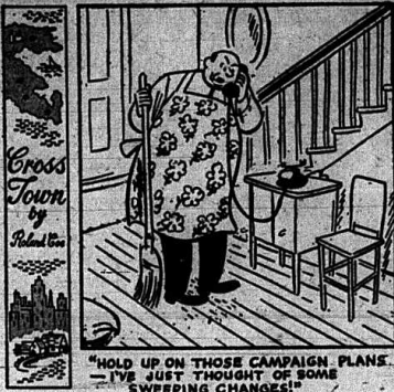
'HOLD UP ON THOSE CAMPAIGN PLANS - I'VE JUST THOUGHT OF SOME SWEEPING CHANGES!