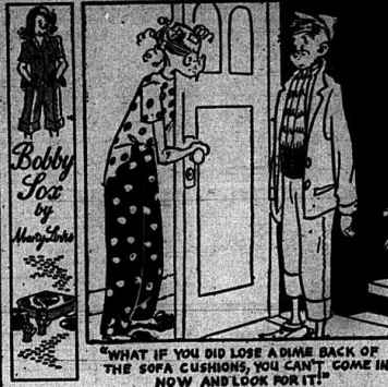
'WHAT IF YOU DID LOSE A DIME BACK OF THE SOFA, CUSHIONS, YOU CAN'T COME IN NOW AND LOOK FOR IT!'