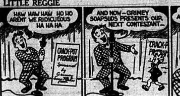
LITTLE REGGIE HAW HAW HAW! HO HO HO! AMNITY WE RIDICULOUS HA HA HA AND NOW... GRIMEY SOAP'S PRESENTS OUR NEXT CONTESTANT... HA HA! WELL YOUNG MAN - WHAT ARE YOU GOING TO BE WHEN YOU GROW UP? I DON'T KNOW - WHAT ARE YOU GOING TO BE?