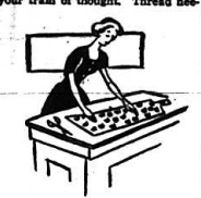
Mark show with chalk.

Everything needed for the sewing project should be assembled, to prevent running out for basting thread or needles, and thus interrupting your train of thought. Thread ne-