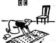
Cal fabrics on a floor...

SEWING CIRCLE PATTERN DEPT. 1221 South Wacker Dr. Chicago 7, Ill. Enclose 25 cents in coin for each pattern desired.