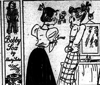
"NO, IT'S ENOUGH! YOU REMEMBER! THE BOY YOU WERE GOING TO SPEND THE REST OF YOUR LIFE WITH LAST MONTH!"