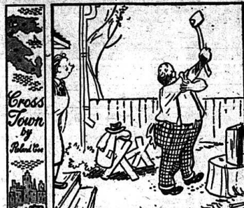
"FOLLOW THE HARVESTS. IN THE CHERRY PIE SEASON I WORK THE CHERRY COUNTRY, IN THE APPLE PIE SEASON, THE APPLE BELT."