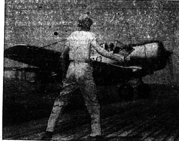
Engine "revved up" for take-off, a Naval Aviation Cadet aboard the practice carrier USS Wright at Pensacola Naval Air Station gets the go-ahead signal from the flight dispatcher of an air group. Pensacola Naval Air Station, the "Annapolis of the Air," is the focus of the recently reactivated Naval Aviation Cadet training program, which is open to healthy, single young men between 18 and 25, with at least two years of college. Upon graduation they are commissioned ensigns in the Naval Reserve, or second lieutenants in the Marine Corps Reserve, are awarded their wings and assigned to two years' active duty.