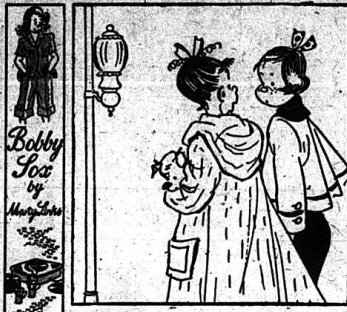
"MY FOLKS REFUSE TO RAISE MY ALLOWANCE 50¢ BUT THEY'LL TOSS AWAY $300 ON MY VIOLIN LESSONS."