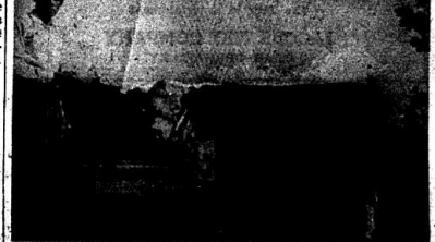
BURDETTE'S GRAND CHAMPION CALF