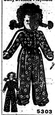
Stuffed and Sleepy 5303