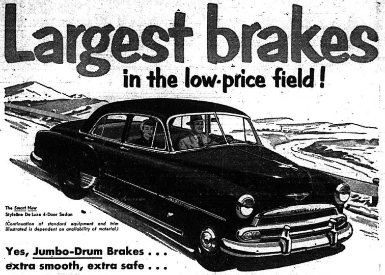
The Smart New Styline De Luxe 4-Door Sedan (Continuation of standard equipment and trim illustrated is dependent on availability of material)

CERTA - VIN is helping such victims right and left here in MOUNT VERNON. This new medicine helps you digest food faster and better. It is taken before meals; thus it works with your food. Gas pains go! Inches of blood wash! Contains Herbs and Vitamin B - 1 with Iron to enrich the blood and make nerves stronger. Weak, miserable people soon feel different all over. So don't go on suffering. Get Certa - Vin - MILLER'S PHARMACY.