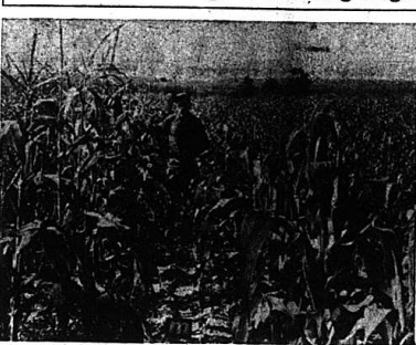
Corn (right) which didn't have the benefit of extra nutrients, couldn't make the growth needed for top yields and quality.