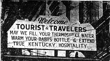
The hospitality that Kentucky is noted for is reflected in this sign over a Bowling Green restaurant. This same hospitality as extended to tourists by all state communities make Kentucky the state in which visitors always desire to return.

First Broken Bull recently brought into Owen County has attracted much interest among rich-brother cattlemen. The bull, one year old and weighing 800 pounds, is one of an estimated 250 situated throughout Kentucky.