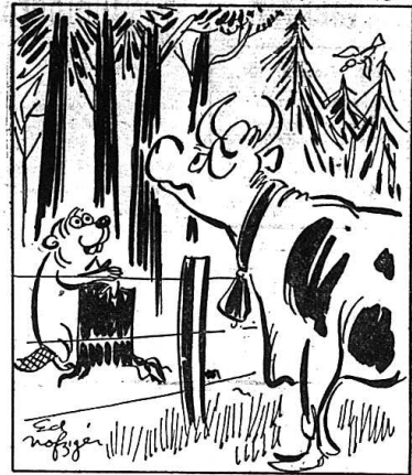
Forest Service, U. S. Department of Agriculture

"But if they burned the woods to give you more grazing land, they'd ruin the watershed, and in time you'd have less grazing land instead of more."