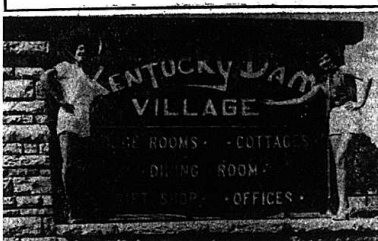
Kentucky Dam Village, one of the state's complete accommodation parks, extends an invitation to year-round vacationers.

First Broken Bull recently brought into Owen County has attracted much interest among rich-brother cattlemen. The bull, one year old and weighing 800 pounds, is one of an estimated 250 situated throughout Kentucky.